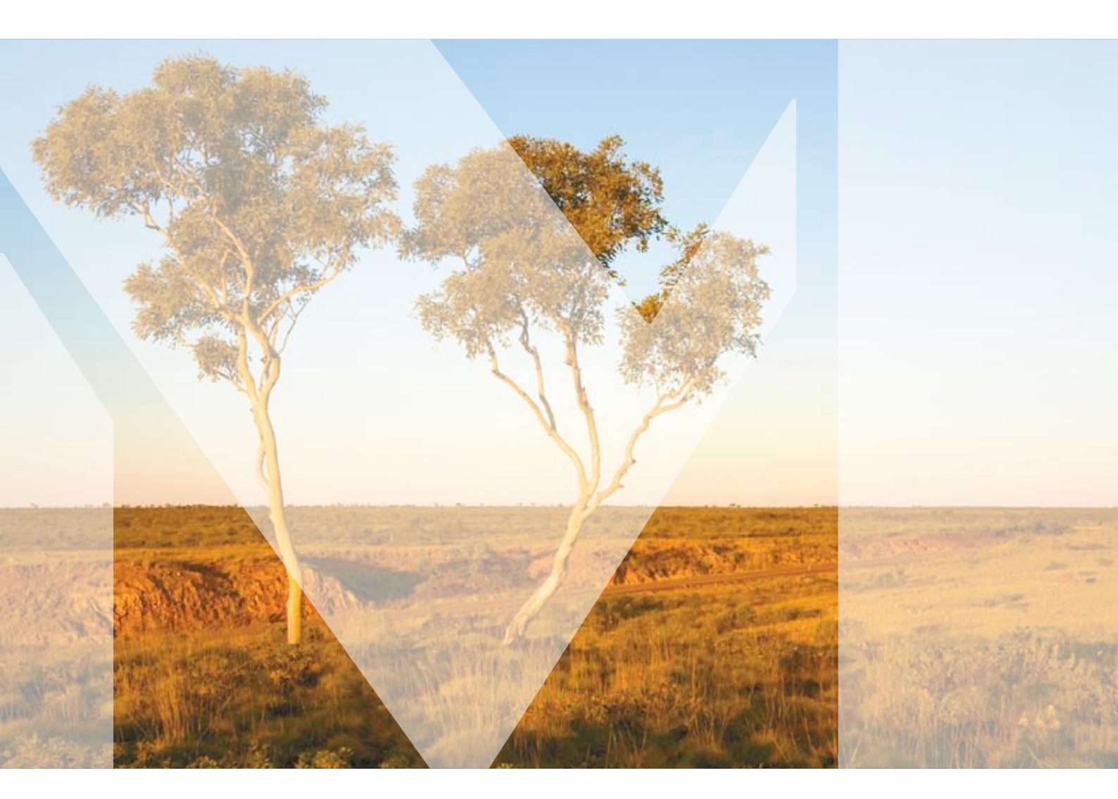
ANNUAL REPORT 2009