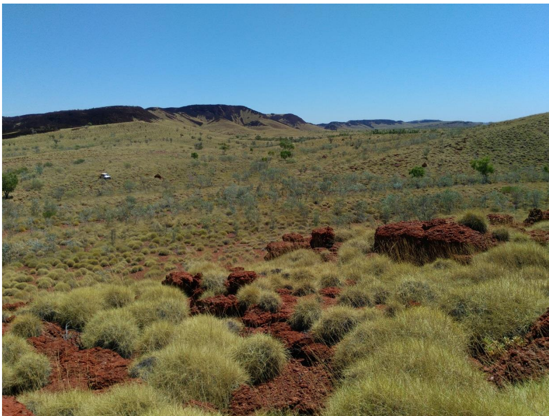
Plate 1. Typical exposure of lower Fortescue Group

Kairos cautions investors that further work is required to confirm the gold-bearing nature of the prospective conglomerate sequences which have been identified within Kairos Minerals tenure.