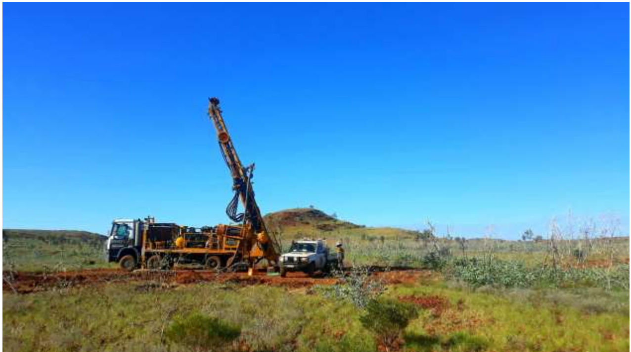
Figure 1: Mt Magnet Reverse Circulation (RC) drill rig operating at the Fuego prospect, Croydon Project.