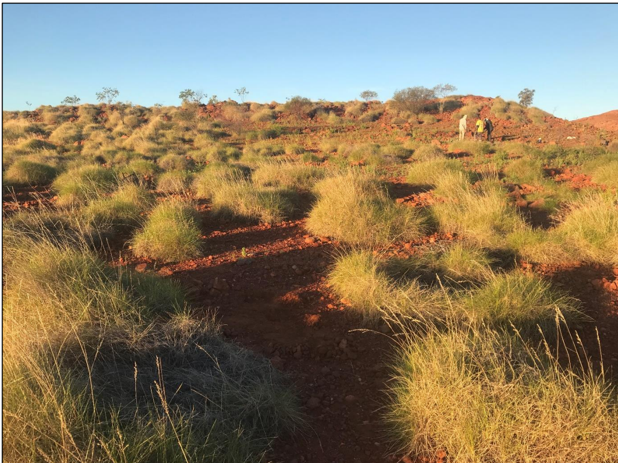
Plate 2: Outlier of conglomerate with nugget patch located through metal detecting

To date, a total of 223 nuggets have been recovered for 656/ 21.1 oz at the base of the conglomerate outcrop near the contact with the granitic rocks of the Archean basement. In addition, the metal detector is also indicating that there is gold in five different locations insitu. A more detailed mapping program is being conducted to define the mineralised horizon within the conglomerate unit.