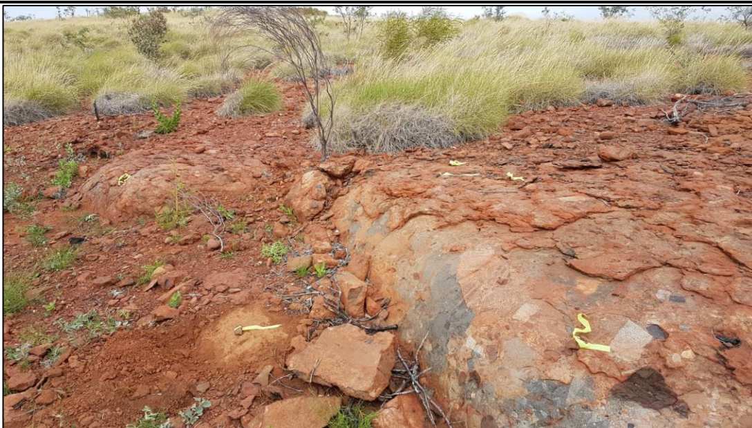
Plate 1 : Mapped conglomerate unit with metal detector strikes (yellow) Croydon Project