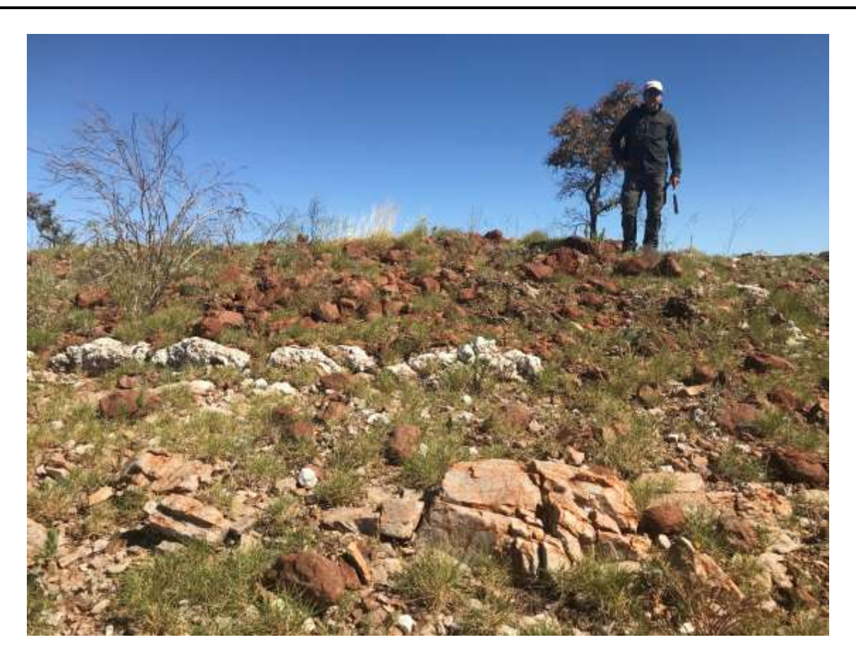
Figure 1: Recent mapping of units of the East Pilbara Terrane, during the recent helicoptersupported field trip on the southeastern area of the Croydon Project.