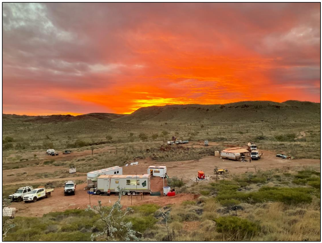
Figure 1: Kairos exploration camp at the Mt York project.